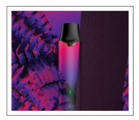
UMBRA SKIN FOR ePod