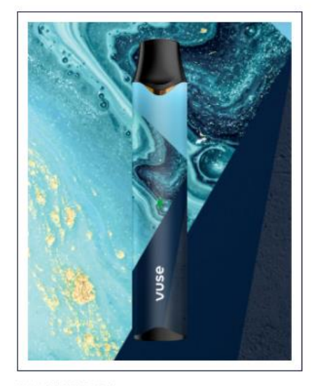
SWAY SKIN FOR ePod