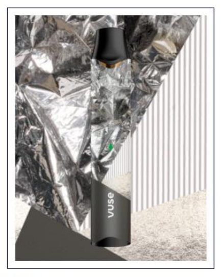
FOIL SKIN FOR ePod